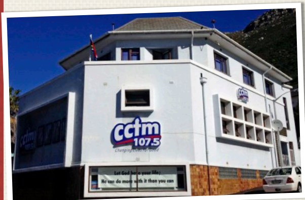
CCFM STUDIOS IN MUIZENBERG

Like a lot of people, we're eager for the release of the second Hobbit film in December. Did you know JRR Tolkien was born in South Africa and lived here until he was three? He claimed to have few memories of SA, except for a vivid encounter with a large spider, an experience put to good use later on in his writings.