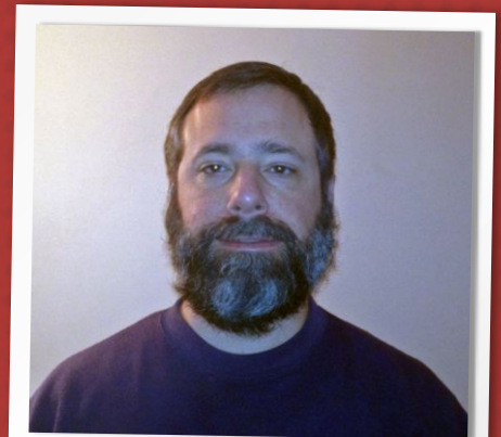
BEARD IN AUGUST