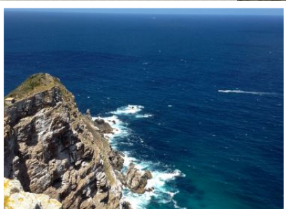
ABOVE: CAPE POINT