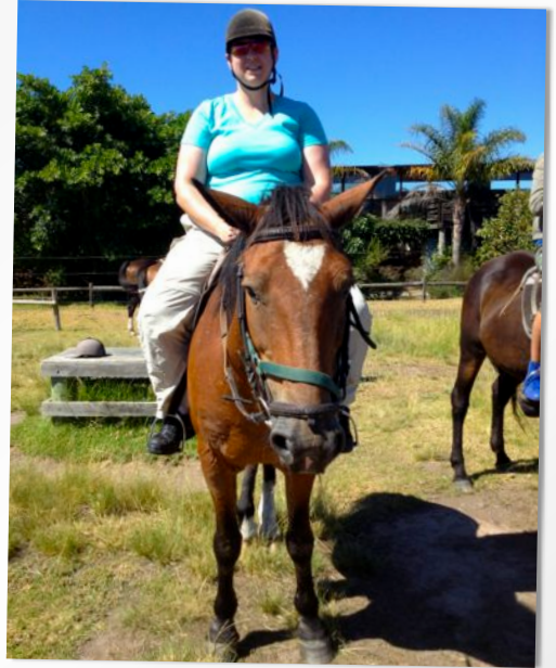
We did a horseback safari one day to a non-carnivore area of a game park.