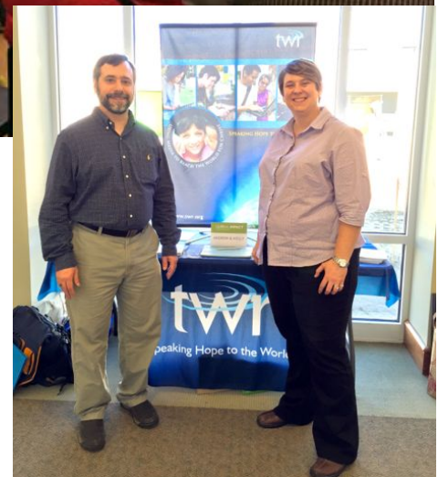
Right: We set up our table in the main hallway along with dozens of other global and local ministries.