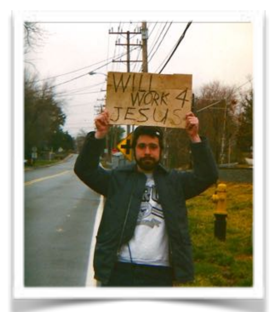
DECEMBER 1996 PHOTO SENT TO THE JESUS FILM PROJECT IN ORLANDO SO THEY'D KNOW WHAT THE NEW GUY LOOKED LIKE.

In the 1990s, cutting-edge media ministry took a two-hour film based on Luke's Gospel shown on 16 mm film and VHS tape to reach Third World audiences. Today, a new breed of missionaries creates short films (often just 3-min. each) drawn from the entire Bible and uploads them to social media networks (Facebook, Twitter, etc.) The primary audience remains people who need to hear that God loves them so they can respond. And while they may not be literate, have running water or reliable