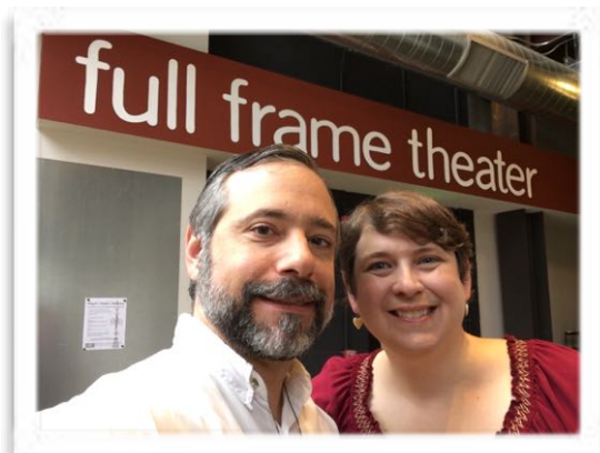
We viewed the final class projects at the Full Frame Theater in downtown Durham.